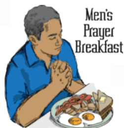
Men's Prayer Breakfast

Contact Karen Moe at moe.karen@yahoo.com to share your thoughts and ideas for educational programming.